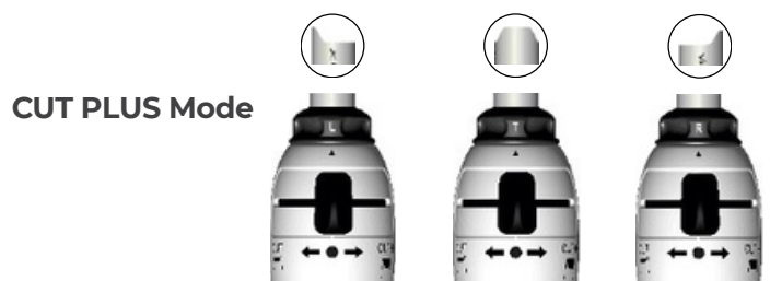
CUT PLUS Mode